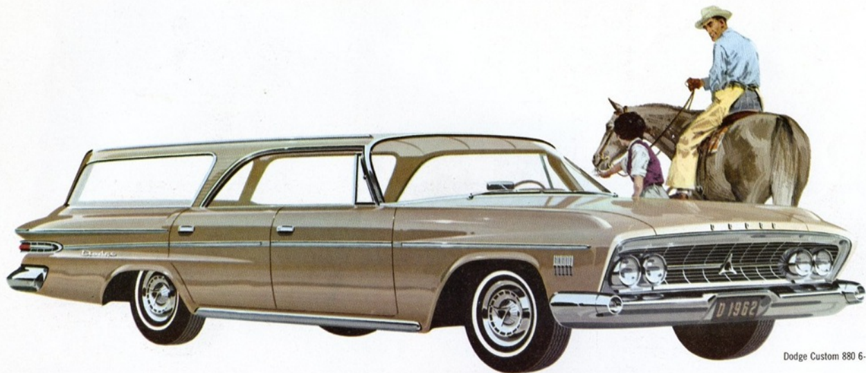
Dodge Custom 880 6-Passenger Wagon

HOLDS THEM ALL! THE LONG THE SHORT & THE TALL!!!