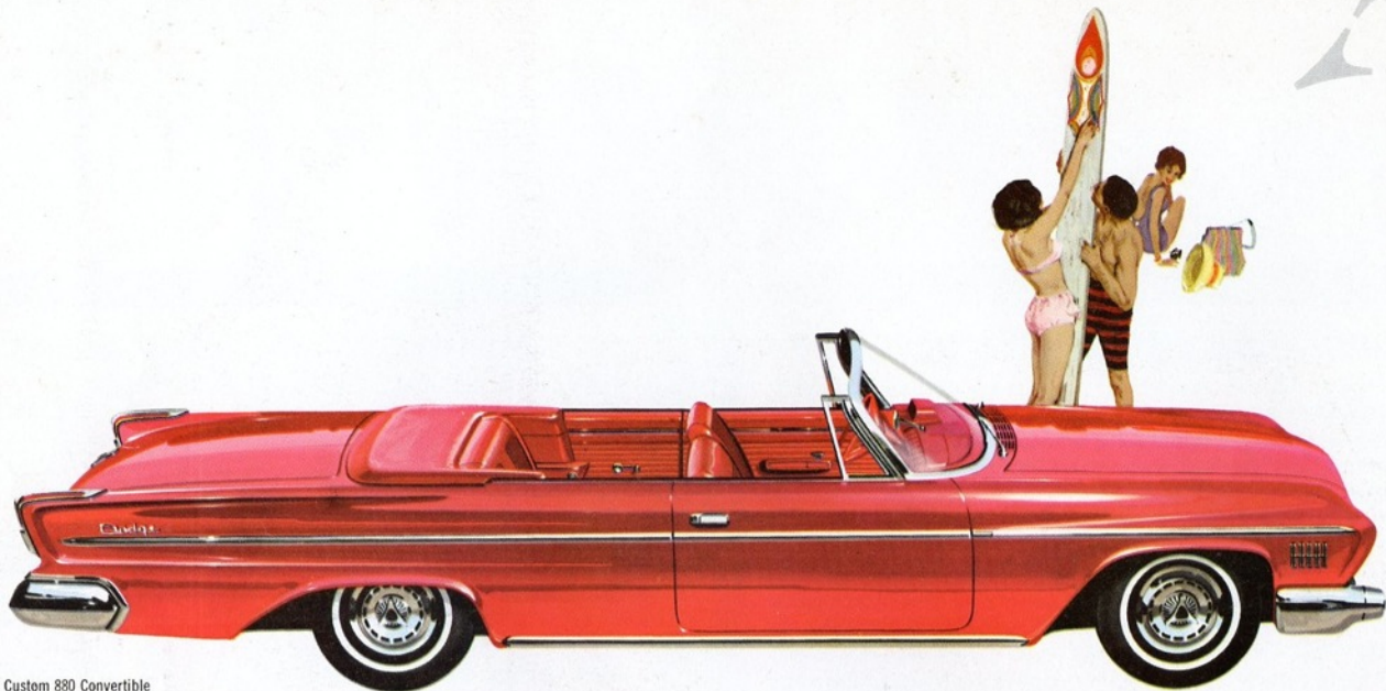
Dodge Custom 880 Convertible