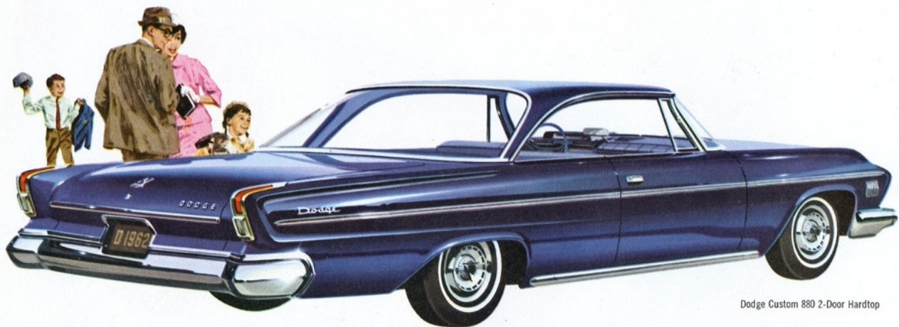
Dodge Custom 880 2-Door Hardtop