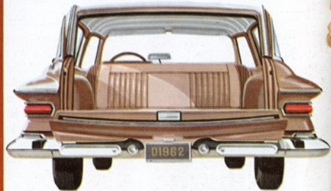
Dodge Custom 880 9-Passenger Wagon

The Dodge Custom 880 is available in two luxurious 4-door hardtop wagons: a 2-seat, 6-passenger model and a 3-seat, 9-passenger model. Third-seat is rear-facing (kids love it). Folds into floor for additional cargo space. Power operated tailgate window is standard on all wagon models. Custom 880 wagons have a mammoth 91.5 cubic-foot cargo capacity. A wide 49.2 inch tailgate opening accepts your load like a bottomless pit. Kegs, cartons, cots, canoes . . . there's room in there for just about anything. (More than ten feet deep from back of front seat to end of open tailgate.) The upholstery is all-vinyl, tailored to take it and come back for more.