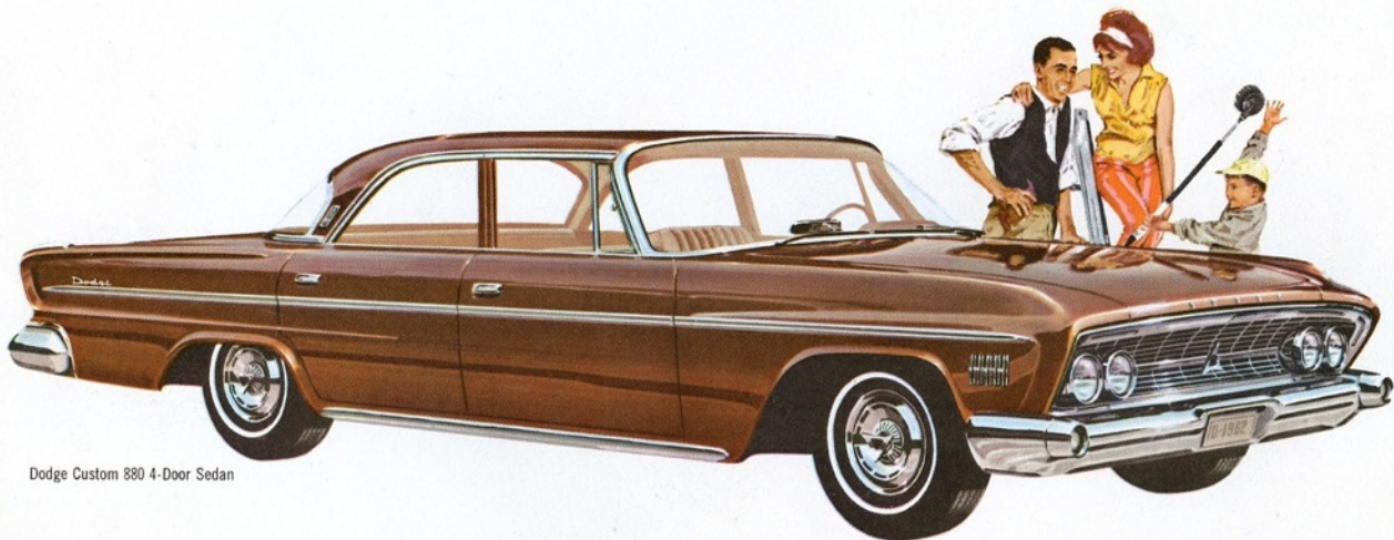
Dodge Custom 880 4-Door Sedan

LOTS OF CAR FOR THE MAN WHO LIKES HIS CAR BIG