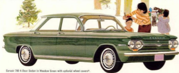
Corvair 700 4-Door Sedan in Meadow Green with optional wheel covers*.