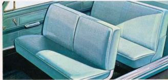
4. Corvair 500: durable, attractive interiors in fawn, aqua and red.