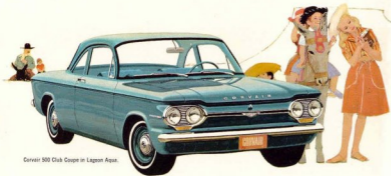
Corvair 500 Club Coupe in Lagoon Aqua.

Skedaddle and Corvair quality make a nice balance of motoring pleasure. And the price of the 500 is right. The initial cost is lowest of all Corvair models. Plenty of things are standard; all-rubber floor mats, 4-wheel independent suspension, dual sun visors, cigarette lighter, front arm rests, forced-air heater. High-Level ventilation, lockable glove box, plus all the driving fun you could ever hope for.