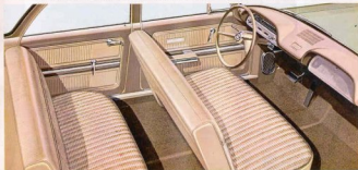
3. Corvair 700, choice of four interiors: red, fawn, aqua and blue.