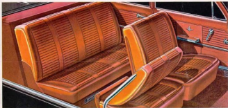
1. Monza Spyder interiors, available in seven colors: red, black, blue, fawn, aqua, white and antique saddle.